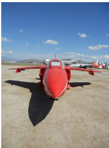
Cover Photo: The Folland FO-141 Gnat seen here at March Field Air Museum was built for the Indian Air Force and was eventually constructed by the Bangalore Division of Hindustan Aeronautics Ltd.